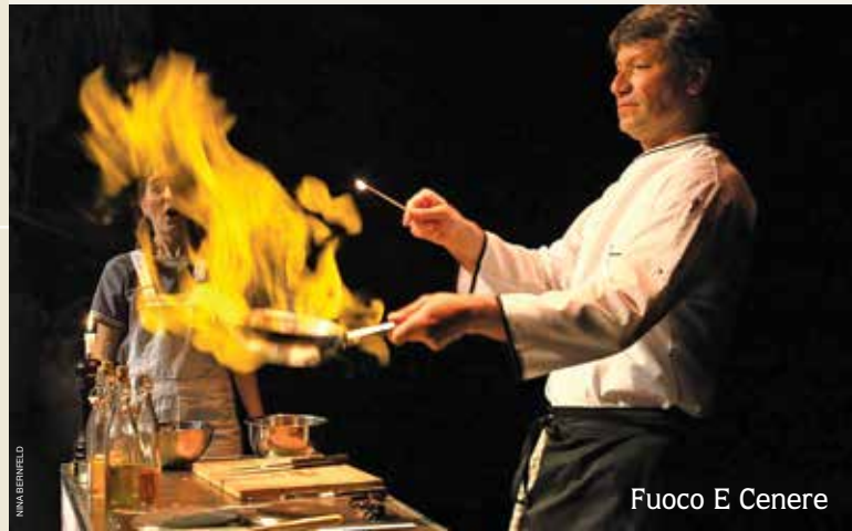
Fuoco E Cenere