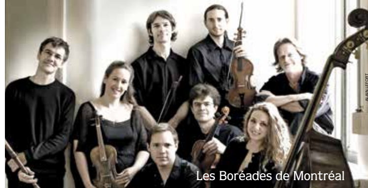
Les Boréades de Montréal

EMSI Patron Services Phone: 250-882-5058 (Please leave a message) Email: info@earlymusicsocietyoftheislands.ca